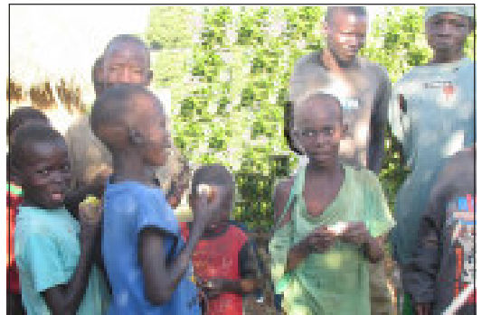
Children enjoying the oranges they have grown themselves from orange tree seedlings