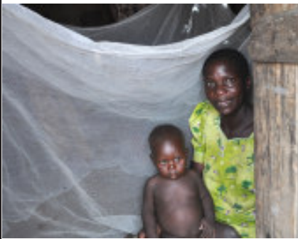
Mosquito net £4

Almost half of all deaths in children under of the age of 5 are caused by malaria. A mosquito net is the best way to prevent this deadly disease but few families can afford them.