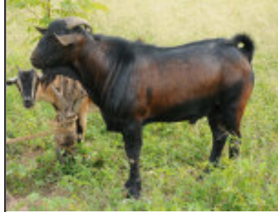
Male goat £35

Improved Ugandan Mubende Elite male goats are given to a village, to be shared for breeding. The aim is to increase the size of the kids to benefit the orphans, as well as the rest of their village.