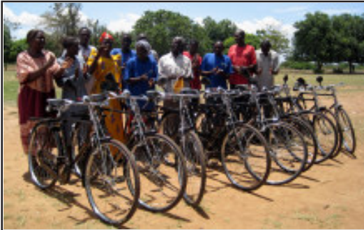
Bike £40 (or pay for half £20)

Bikes are the only means of transport out in the bush (apart from feet!) When they have proved themselves, volunteer workers are given bikes to get around the scattered villages and they can also use them to earn income by transporting goods and people. These brand new bikes are being given to delighted volunteers in Olupe.